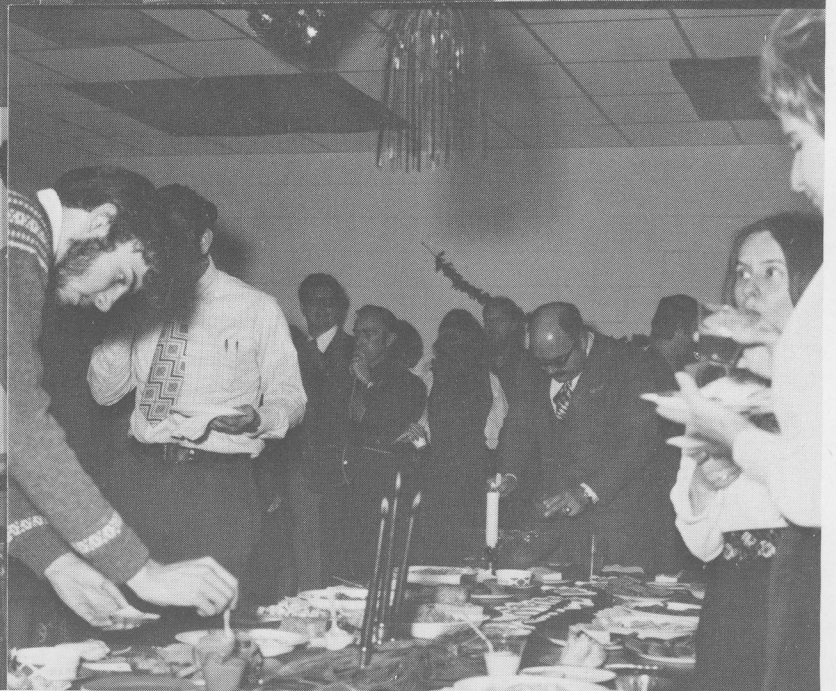
Getting into the Christmas spirits