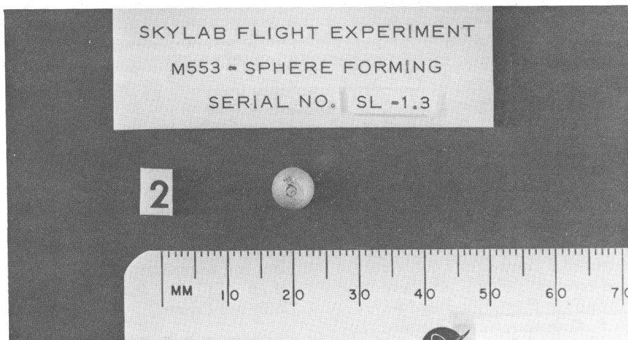
Nickel-tin alloy sphere.