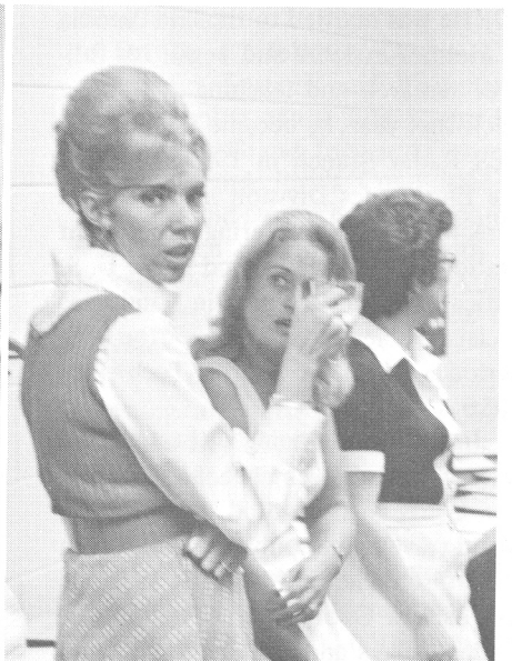
The IDD open house was noteworthy for refreshments and decoration — some of the decorative gals are seen discussing industrial development.