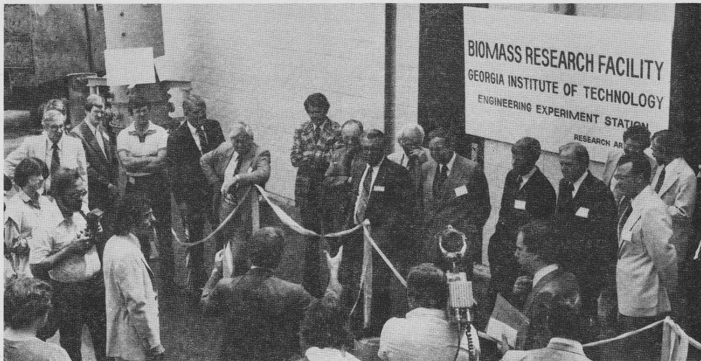
Members of the Joint Senate and House Committee on Energy are briefed on the production of synthetic fuels from wood, grains and grasses at the dedication of Tech's Biomass Research Facility.